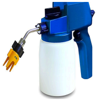
Vision Oil Spray Gun