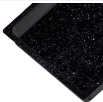
Enameled GN container